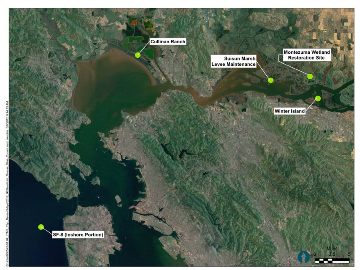
Figure 2 Beneficial Reuse Sites Currently in Operation

Currently, five beneficial reuse sites are permitted and open for accepting dredged sediment in the San Francisco Bay Area. Each site is operated by a different entity who should be contacted for project specific information and needs. These sites are considered multi-user sites and together represent several million cy of capacity within the region. In addition to these multi-user sites, a number of private sites associated with specific dredging projects are currently in operation, such as the Schoellenberger Ponds in Petaluma or the City of Martinez's drying ponds at the Martinez Marina. While these sites are used by individual dredging projects, restoration projects that are in need of sediment many consider these private sites a source of sediment because they need to be routinely emptied to facilitate additional upland placement. The five multi-user beneficial reuse sites are shown on Figure 2 and described in the following sections.