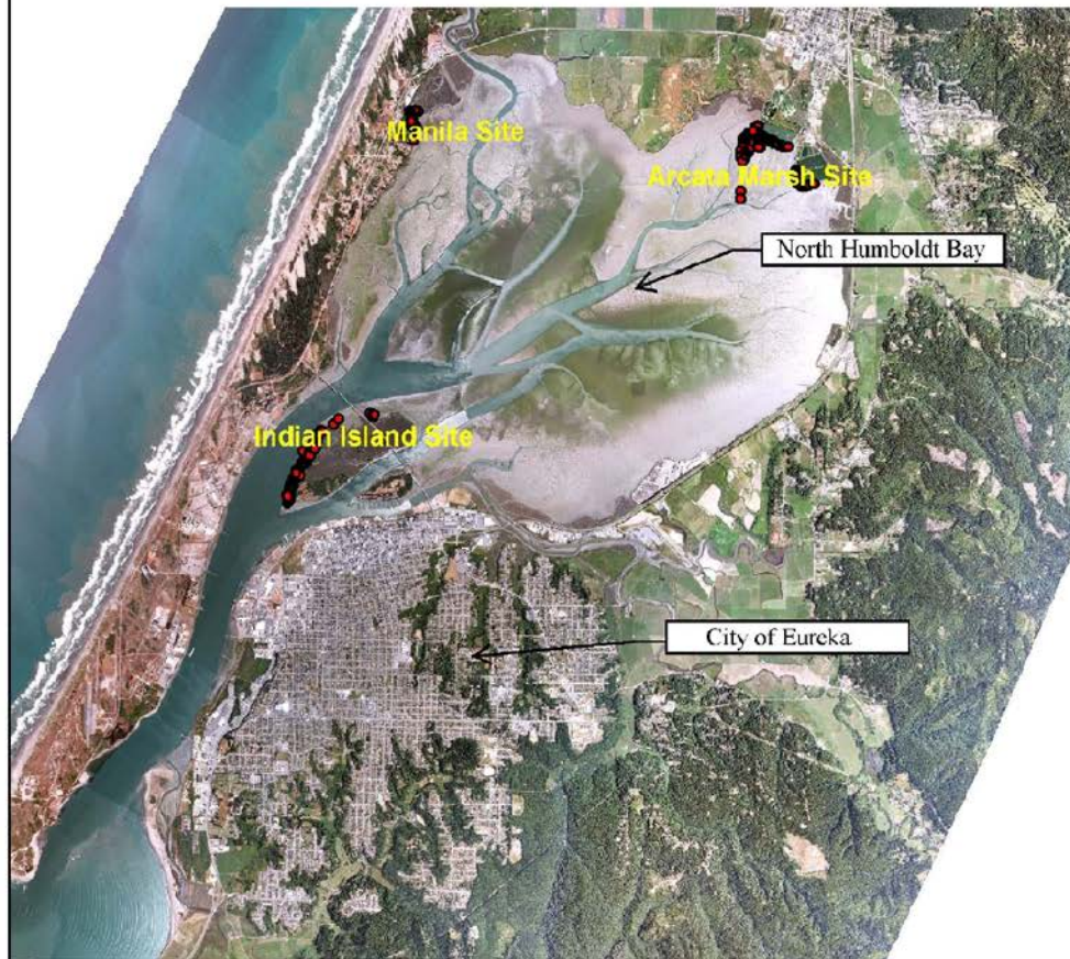
Figure 1. Locations of Invasive Eelgrass Removal Sites, Northern Humboldt Bay

Humboldt Estuarine Complex Restoration Project Estuary Restoration Act