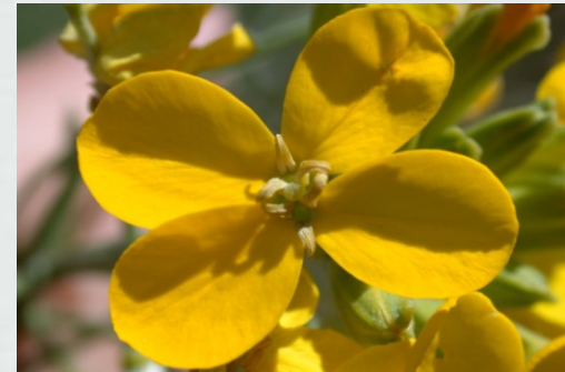
Contra Costa wallflower ( Erysimum capitatum var. angustatum , Endangered )