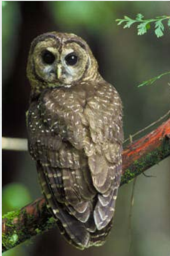
Northern spotted owl ( Strix occidentalis caurina , Threatened )