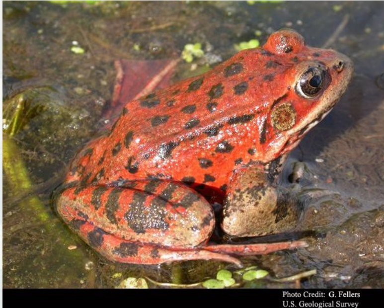
California Red-legged Frog ( Rana draytonii , Threatened )