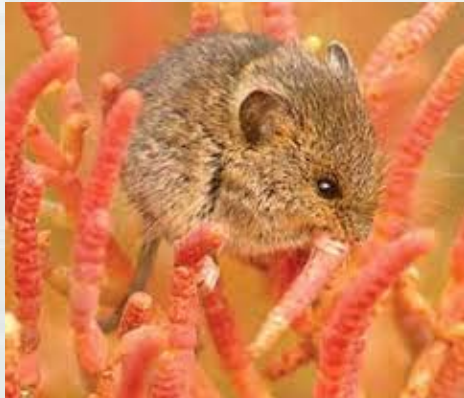
Salt marsh harvest mouse ( Reithrodontomys raviventris , Endangered )