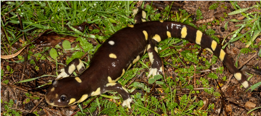
California tiger salamander (Ambystoma californiense)