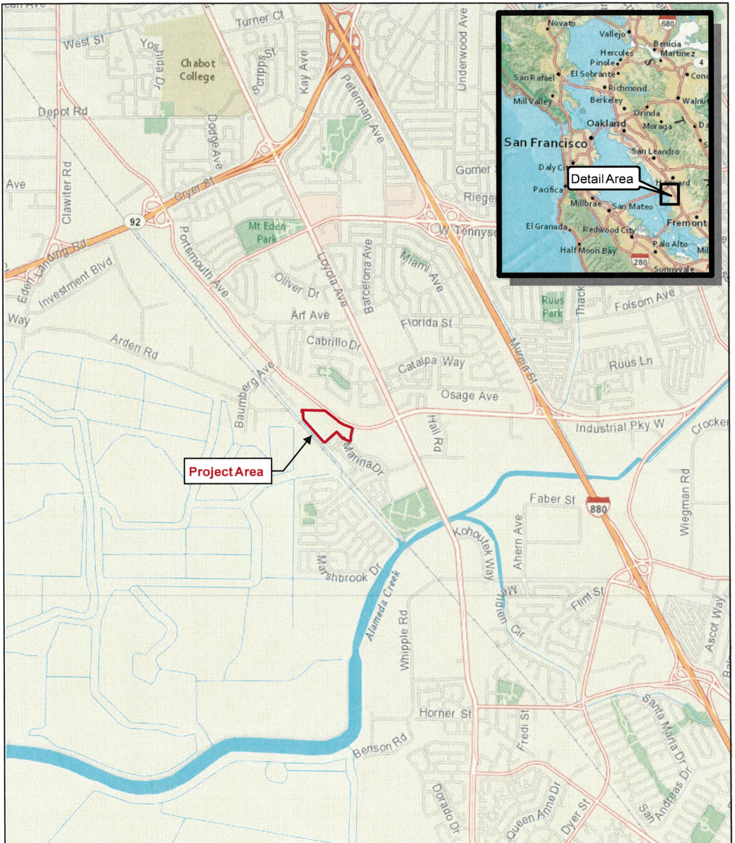
Figure 1. Project Area Location Map