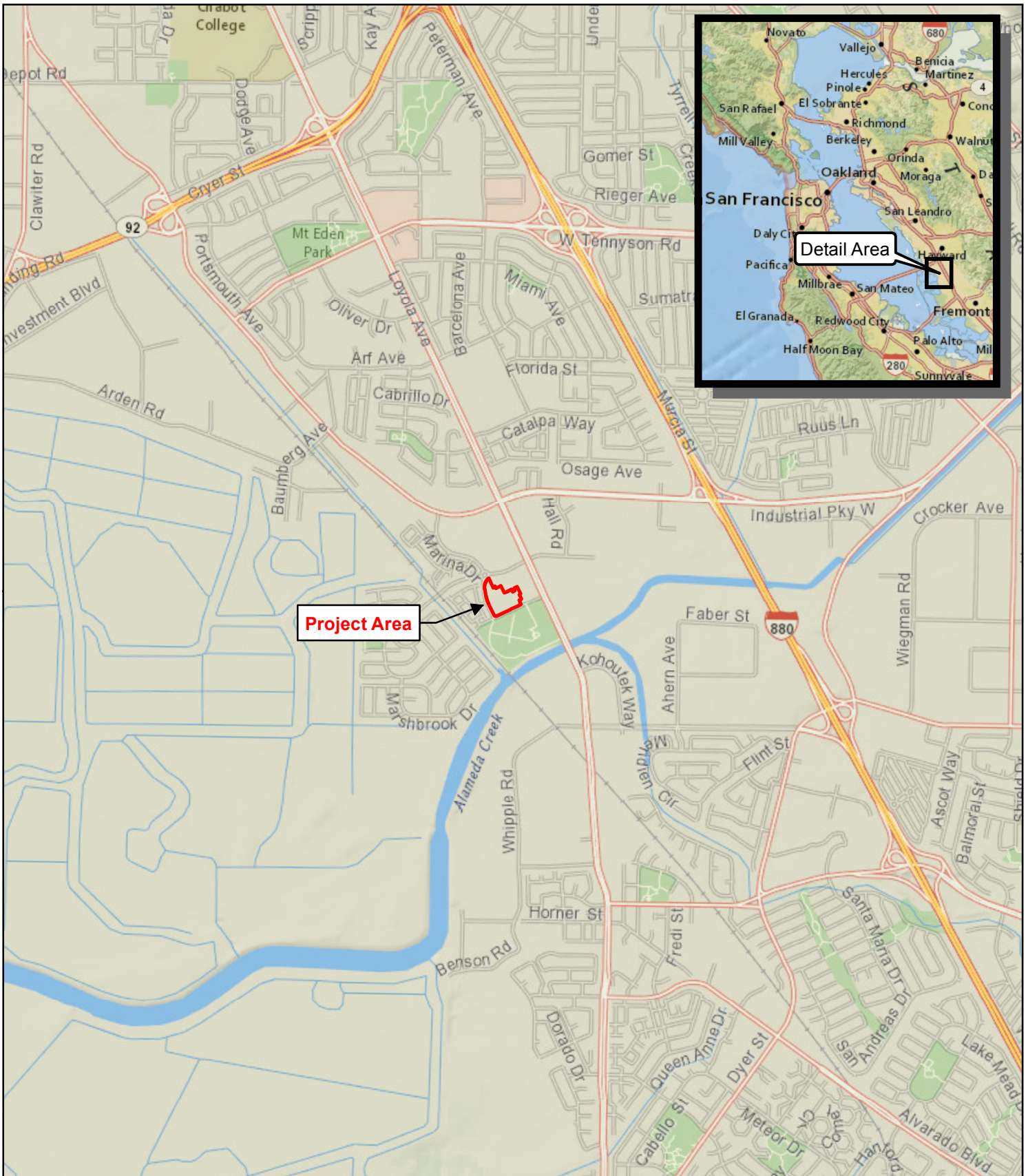
Figure 1 of 2. Project Area Location Map Corps reference number (SPN-24156)

Legacy Partners LLC Eden Shores Residential 2 Alameda County, California Lat: 37.612827; Lon: -122.087405