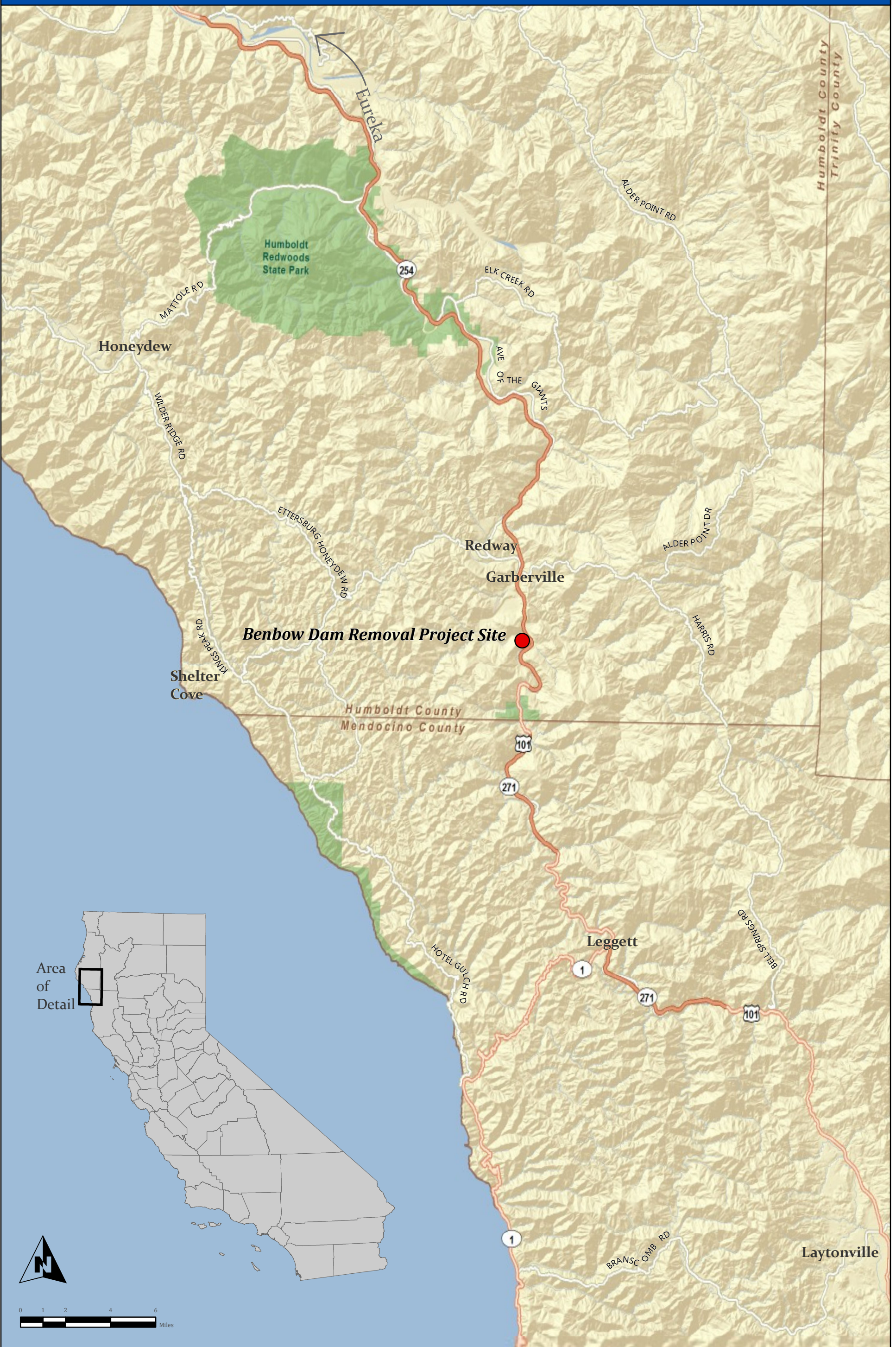
Fig. 1 Vicinity Map