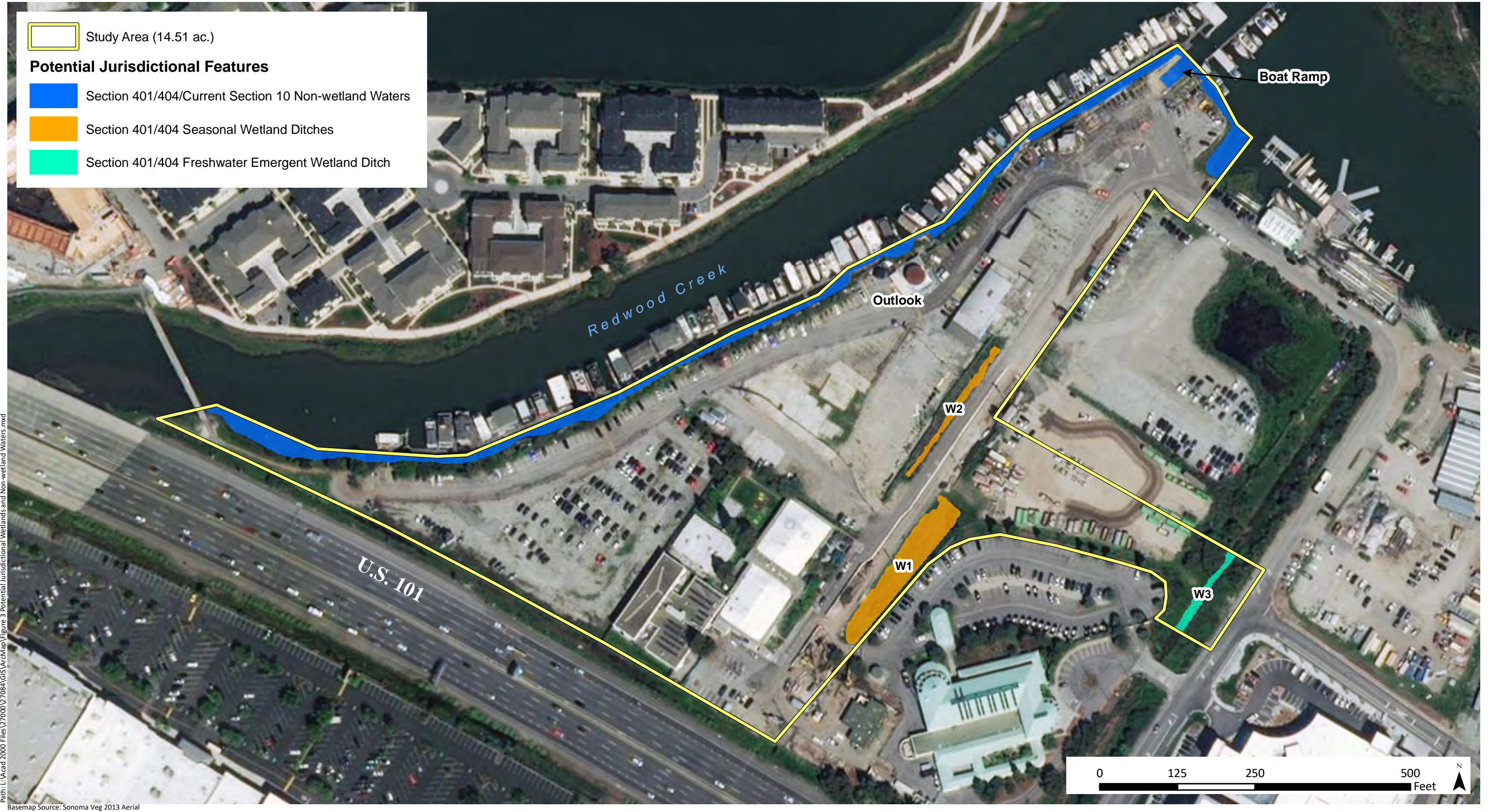
Figure 3. Potential Jurisdictional Wetlands and Non-wetland Waters

1548 Maple St., Redwood City Biological Services Redwood City, California