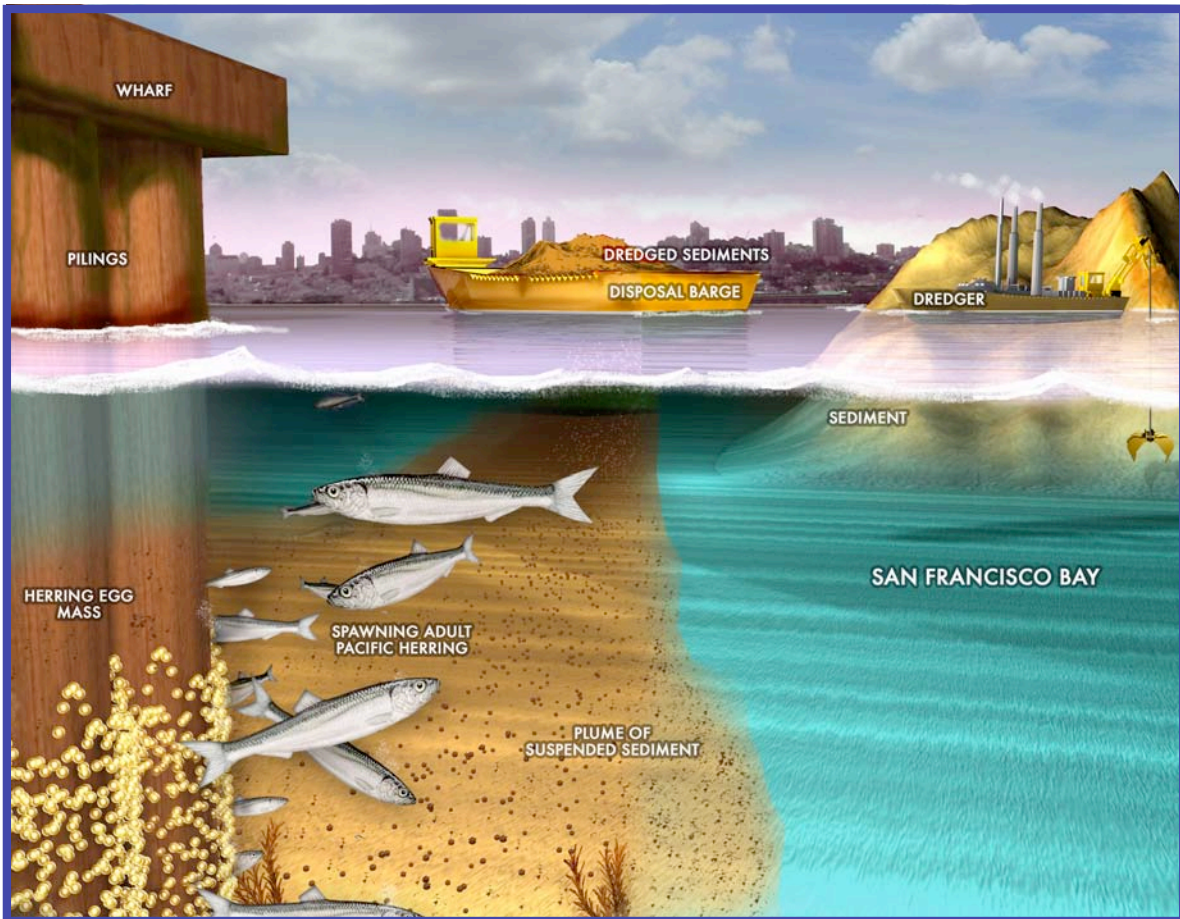
Figure 1. A conceptual model of how Pacific herring might be exposed to dredging-related suspended sediments during critical reproductive life stages.

suspended sediments, with a threshold avoidance response at 9-12 mg/L suspended sediments, and the magnitude of the avoidance response increasing as the suspended sediment concentration increased. This suggests that adult Pacific herring may well exhibit a similar avoidance response to dredging-related suspended sediments.