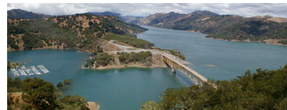
Lake Sonoma, Vol. 1, Issue 1, Fall 2009