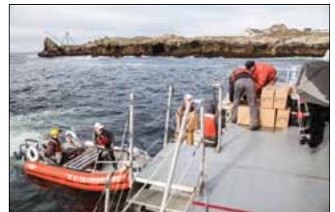
Crewmembers offload supply boxes from the deck of the M/V Dillard for researchers at the Farallon Islands.

And so it was in April when a scheduled resupply ship broke down that the