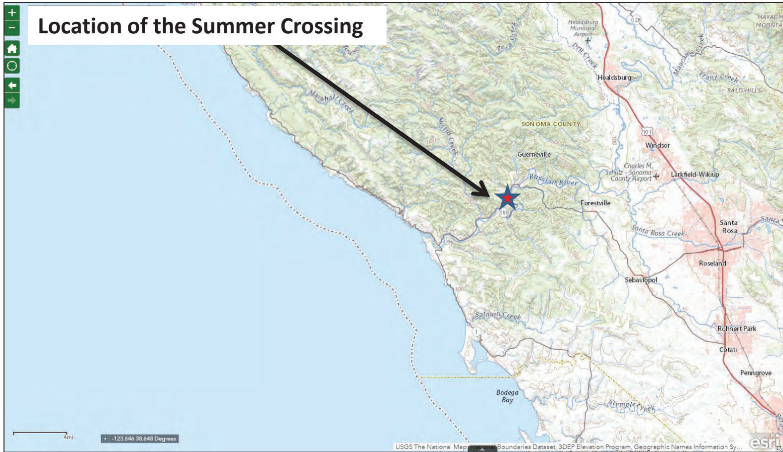
Figure 1 – Project Vicinity Map Vacation Beach Summer Crossing County of Sonoma September 2020