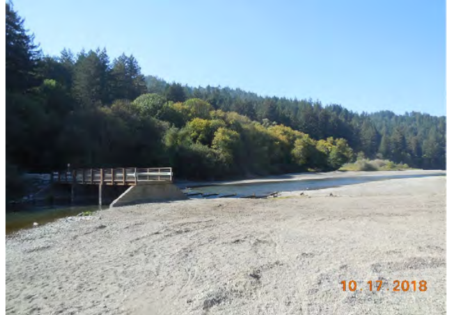
Photo 3. Crossing removed and closed for winter season, 2018.