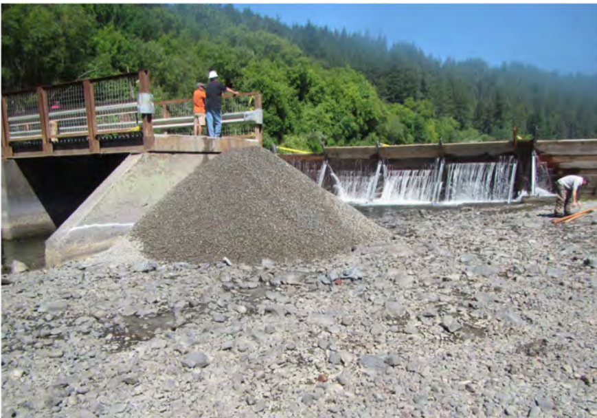
Photo 2. Clean gravel placed near wetted flow to serve as roadway base. Russian River Recreation and Parks District Dam in background.