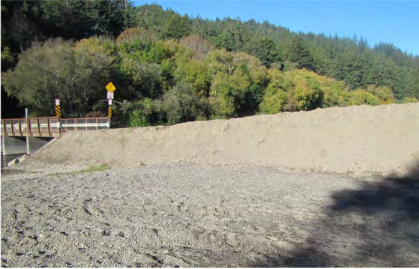
Photo 4. Completed crossing, looking north toward temporary bridge.