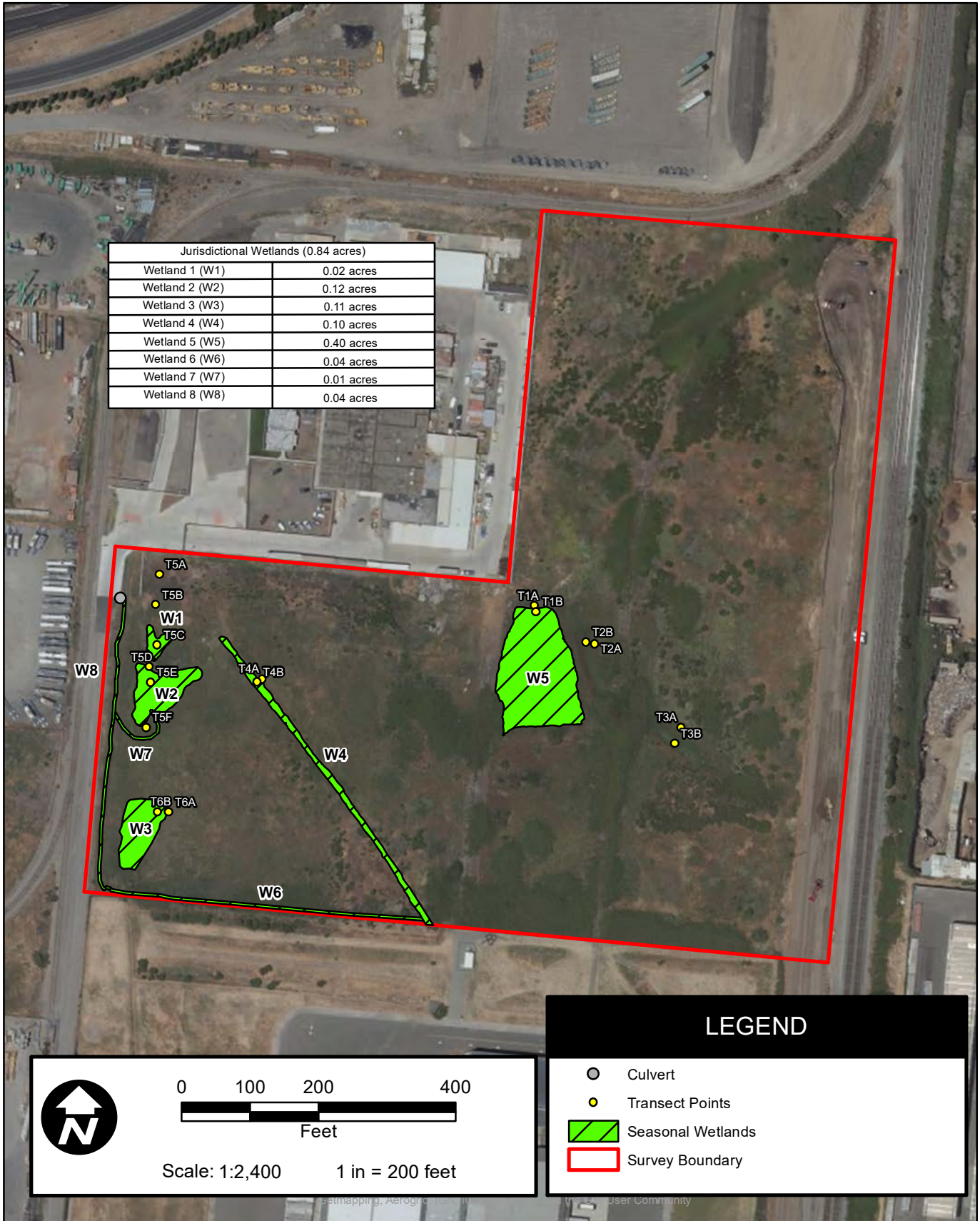
Figure 3: Jurisdictional Delineation Map